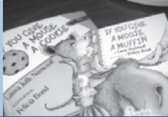
Selections from the Adapted Books Library